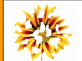
Diabetic retinopathy Causes reduced visions, sensitivity to glare and decreased night vision.