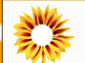
Macular degeneration Blurs central vision used for detailed tasks.