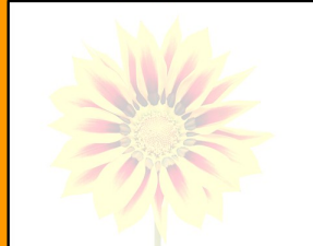
Cataracts Can lead to blurred vision and sensitivity glare