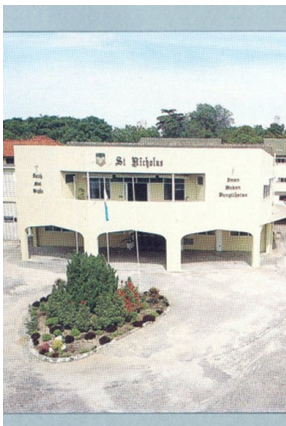
St. Nicholas' Home