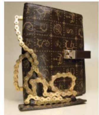
The business of heritage