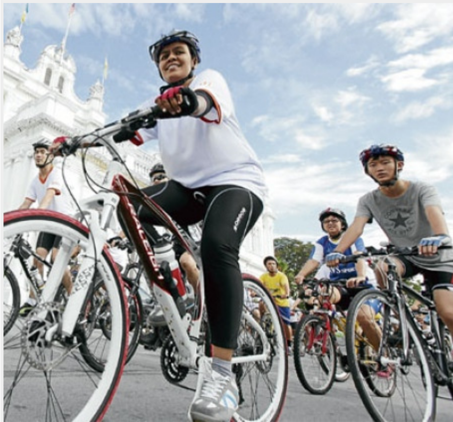
The participants cycling by the Town Hall building at the Esplanade in George Town.

GEORGE TOWN: Some 1,000 cyclists took to the streets recently to support the Ride For Sight 2012 Charity Bikethon at the Straits Quay here.